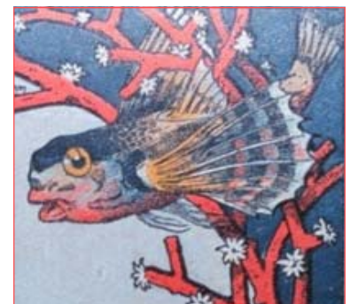
Das Meer, (Cover Inset) MJ Schleiden, 1874,

For more information go to www.siuslawwaters.org