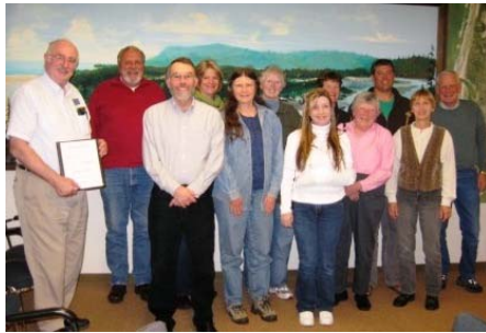
Community Stakeholders Group

The Siuslaw Estuary Partnership is a collaborative effort of federal, state, and local partners to protect and improve water quality and fish and wildlife habitat in the lower Siuslaw River Watershed. This 3 year project is funded by project partners and the US Environmental Protection Agency. An Interdisciplinary Team of 18 partners and 2 stakeholder groups provide guidance on the project.