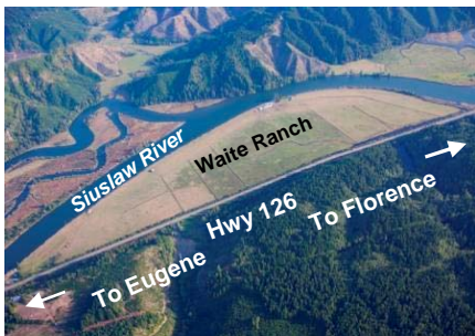
Roy Lowe, USFWS

Waite Ranch, 217 acres, former cattle ranch to be restored with tidal connectivity