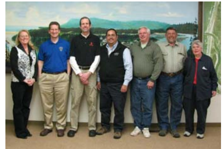
Elected Officials Stakeholders Group

Go to siuslawwaters.org for a list of stakeholder members and their affiliations.