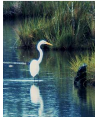
Great Egret, An inhabitant of the Siuslaw Estuary