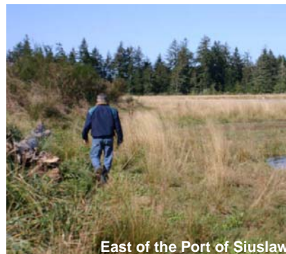
East of the Port of Siuslaw

For a sneak preview, see the Draft Report for the Siuslaw Estuary Trail Vision: Location and Design Options on the web site, www.siuslawwaters.org .